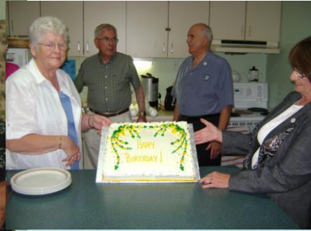
Dykeland Lodge 2011- Blomidon Council 918 sponsored the month of September Birthdays in Dykeland Lodge, by celebrating 19 Birthdays.