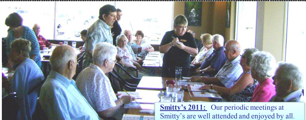
Smitty's 2011: Our periodic meetings at Smitty's are well attended and enjoyed by all.