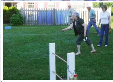
Blomidon BBQ 2011- A full turn-out for our annual BBQ. Good Food, Fellowship, Fun & Games was had by all